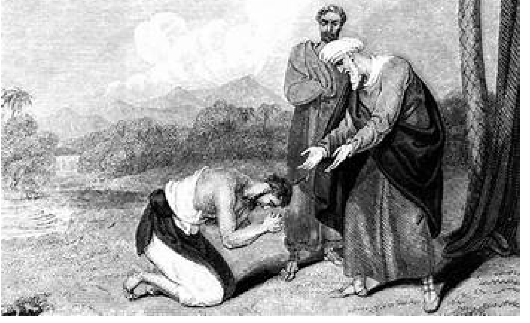
Many are the scourges of the sinner, but mercy shall encompass him that hope in the Lord. Ps 31: 10