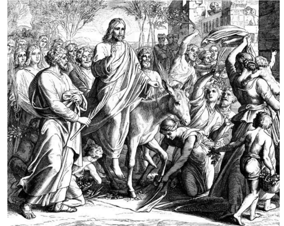
Palm Sunday Entry by Jesus

Engraving by Julius Schnorr von Carolsfeld (March 26, 1794 - May 24, 1872)