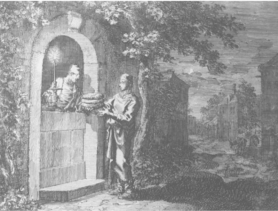
ASK AND YE SHALL RECEIVE. LUKE 11:5-8 JAN LUYKEN