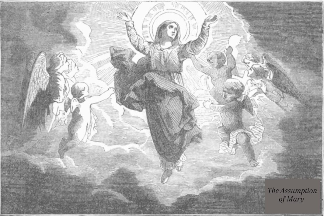
The Assumption of Mary