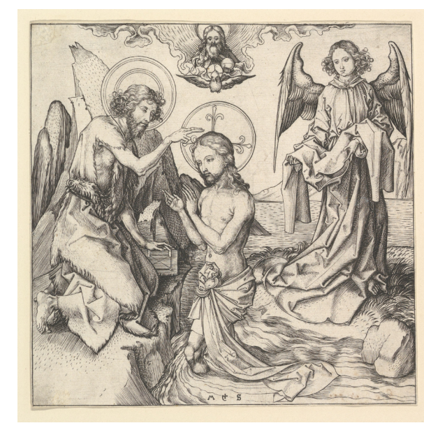
Baptism of Christ ca. 1470–74 <u>Martin Schongauer</u> German