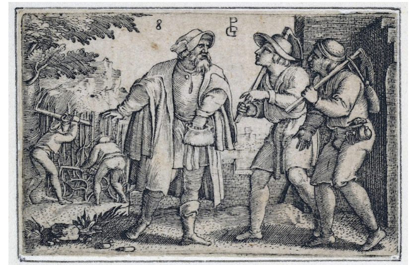
THE PARABLE OF THE FATHER AND HIS TWO SONS IN THE VINEYARD