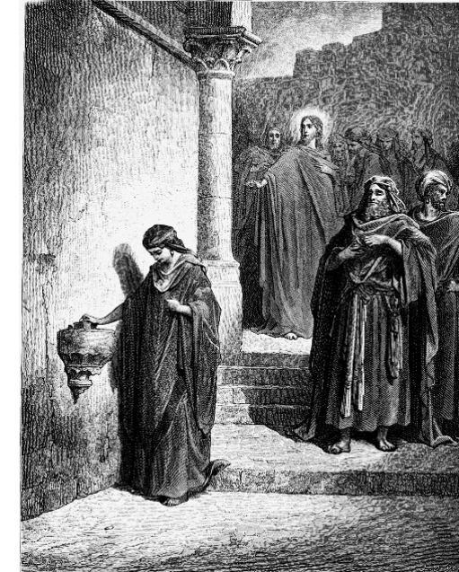
THE WIDOW'S MITE BY: GUSTAVE DORÉ (1832-1883)

“Truly, I say to you, this poor widow has put in more than all those who are contributing to the treasury. For they all contributed out of their abundance; but she out of her poverty has put everything she had, her whole living.”