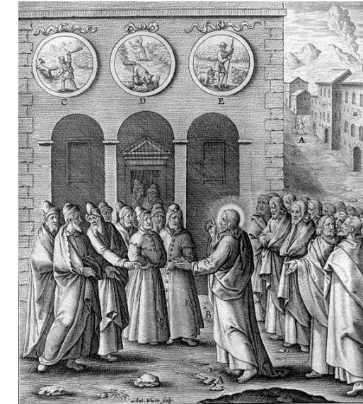
THE GOOD SHEPHERD