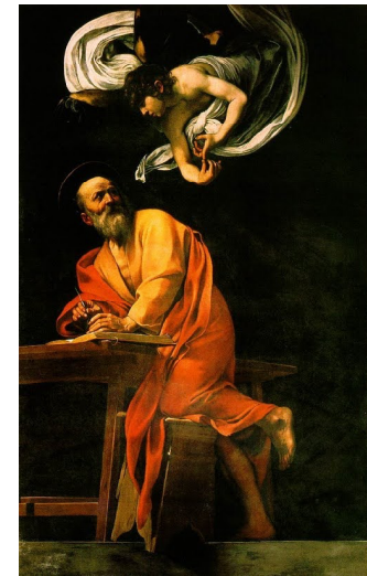
ST. MATTHEW AND THE ANGEL Caravaggio 1573 – 1610