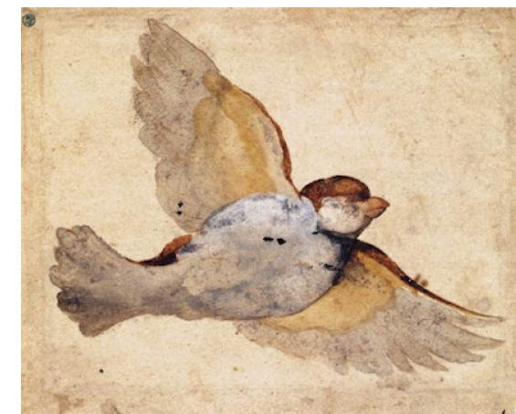
STUDY OF A FLYING SPARROW Giovanni da Udine 1487-1564