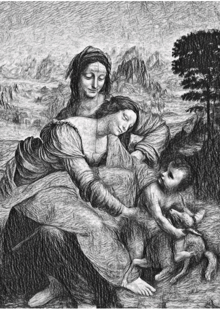
Virgin and Child with St. Ann