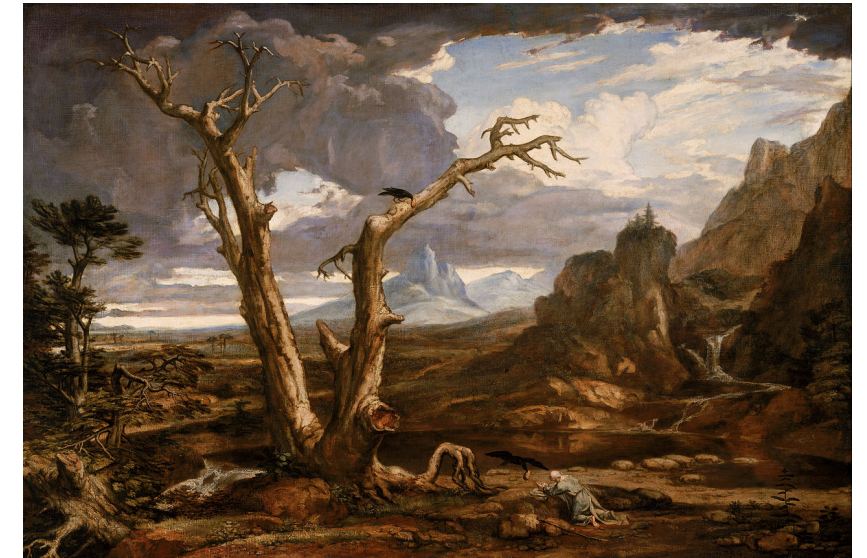
Elijah in the Desert