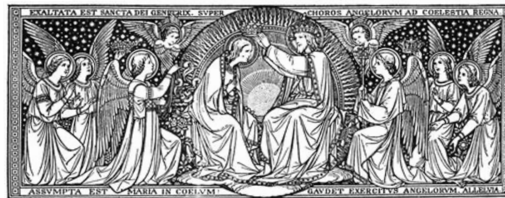
The Assumption of the Blessed Virgin Mary