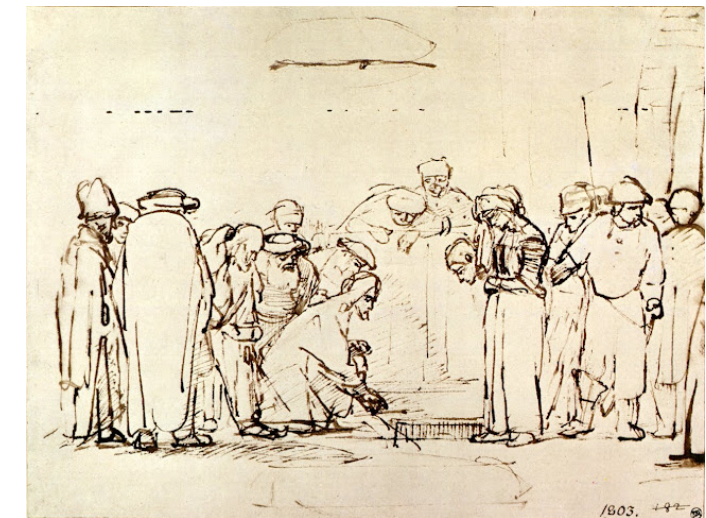
Christ and the Woman Taken in Adultery